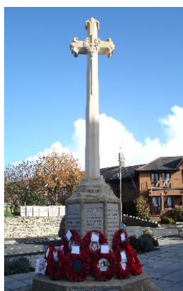
Poppies at the War Memorial and in the Parish Garden